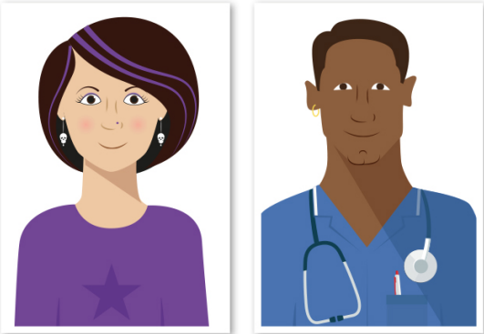
No two people are the same

Each human being has characteristics that make them who they are. These characteristics include physical appearance, personality, beliefs and opinions, likes and dislikes and hobbies. The different characteristics that a person has make up their identity. All people are unique.