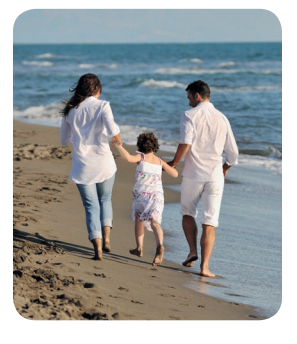
Never go near water alone. Make sure an adult is with you.