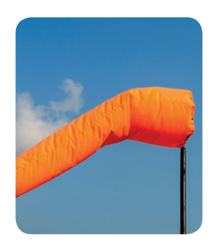
Do not use inflatable toys or airbeds in the sea when a wind sock is blowing.