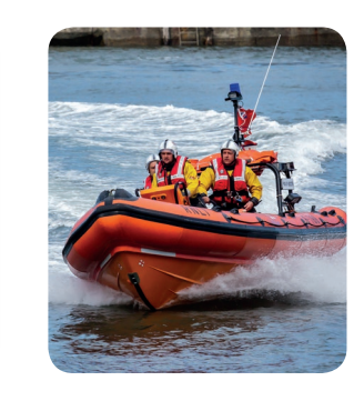
Call 999 in an emergency. Ask for the coastguard and they will call for the lifeboat.