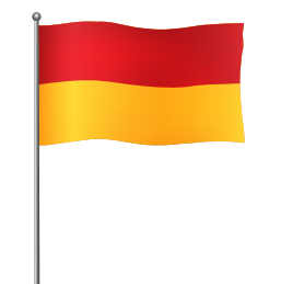
Red and yellow flags mean it is safe to swim.