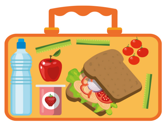
Example of a nutritional packed lunch based on the Eatwell Guide

Choosing nutritional food for a packed lunch can be tricky, especially because processed food and snacks can contain lots of fat and sugar. Choosing a variety of foods from the Eatwell Guide can help to make packed lunches healthier.